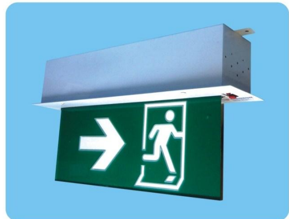
JXPL-400-NH-Elite-F, the character is used in Hotel, Cotai