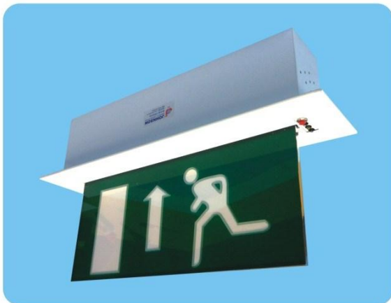
JXPL-400-NH-Elite-W with spring to lock in the box