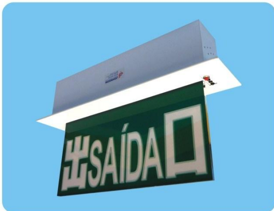
JXPL-400-NH-Elite-Q, Emergency LED EXIT sign Plate with safety chain and crews to fix the Box.