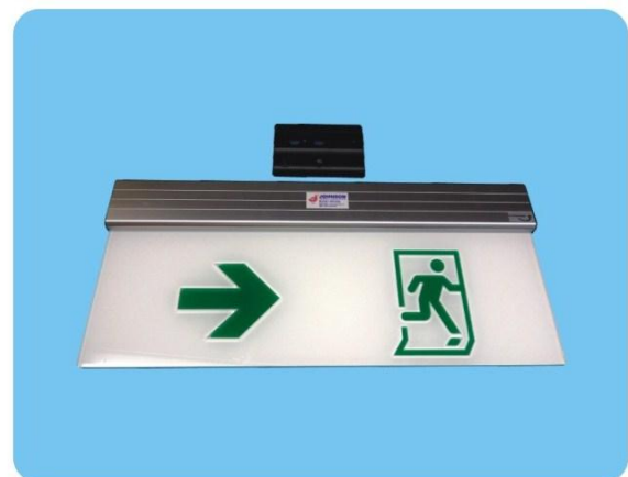
JXPL-600-NH-F with die-cast bracket in black finish.