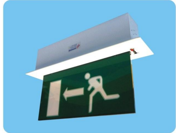
JXP8SNH3-Elite-T, c/w NI-MH rechargeable battery