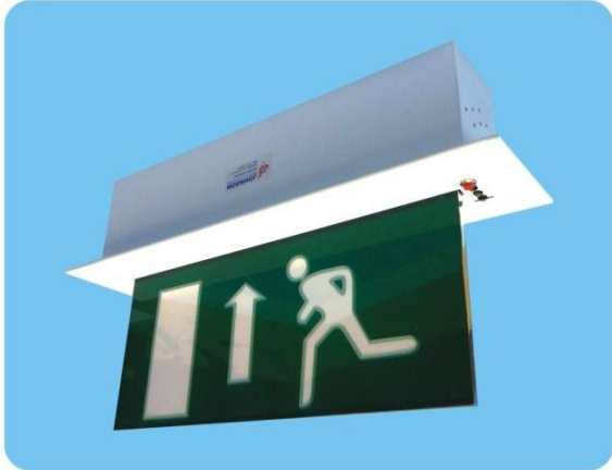
JXP8SN3-Elite-W, 1x8W emergency sign plate, white escape route sign with upward arrow on green background.