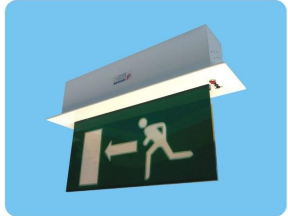
JXP10SNH3-Elite-T, c/w NI-MH rechargeable battery.