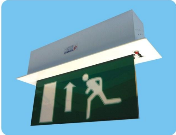
JXP10SN3-Elite-W, 1x10W emergency sign plate, white escape route sign with upward arrow on green background.