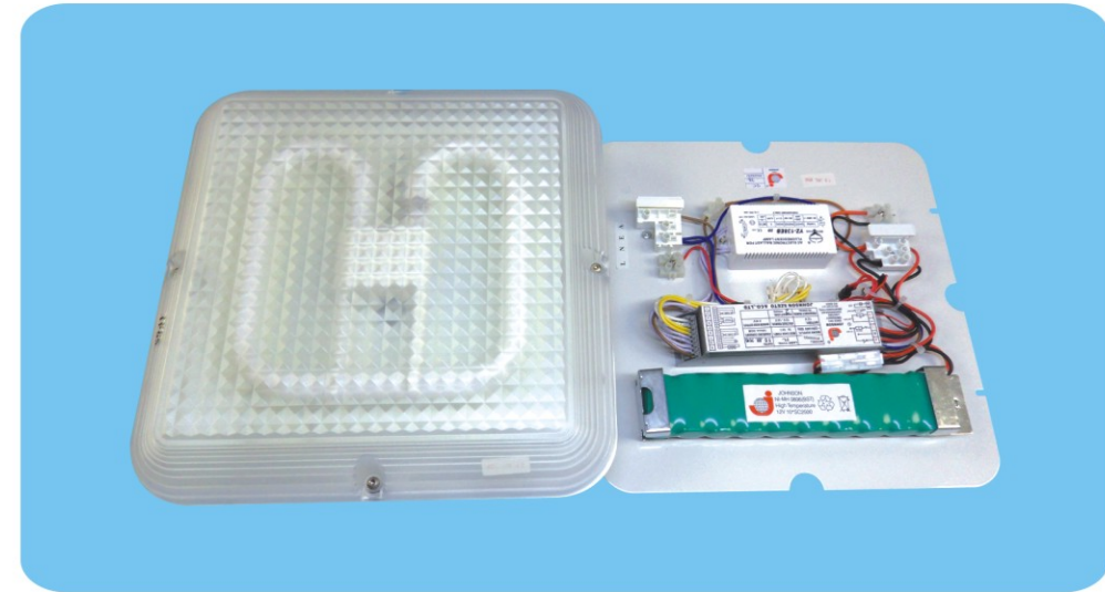
JF2D28NH2, with NI-MH rechargeable battery

: Clients can supply the 2D luminaires for assembly works