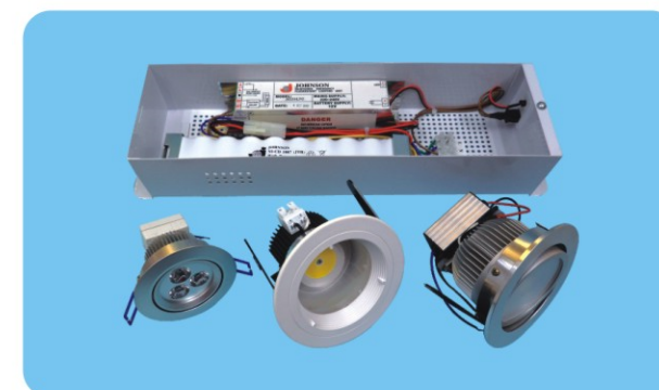
LED downlight luminaires