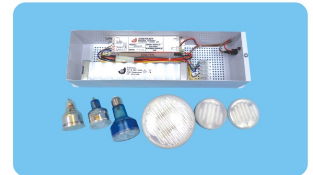
Reflector series / energy saving lamps