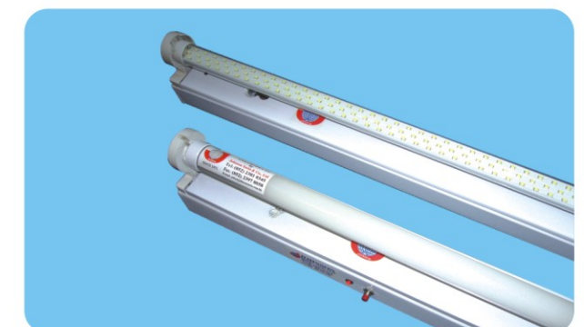
LED tube light