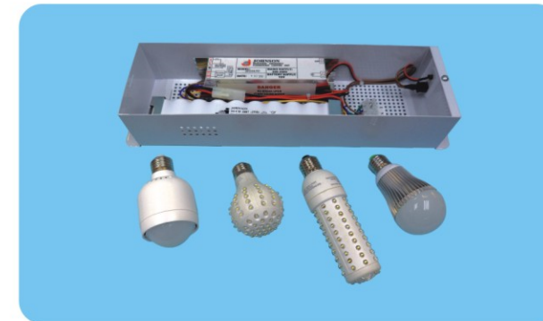
LED lamps: E27