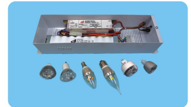
LED lamps: GU4, GU5.3, GU10, E14, E27