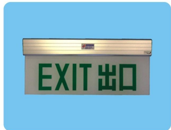
JXPL-600-NH, Emergency EXIT sign plate, white L/C on white background.