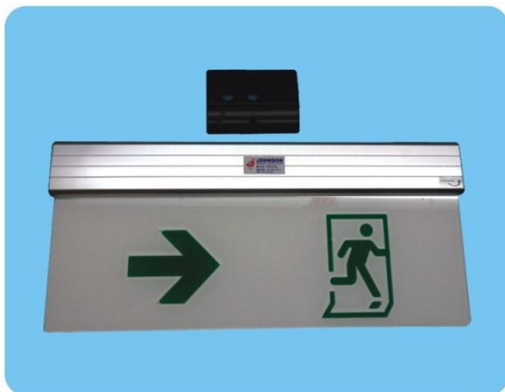
JXPL-600-NH-F, green escape route sign with right directional arrow on white Background.