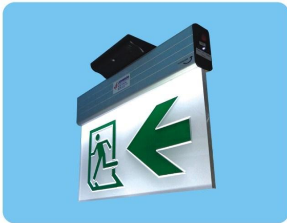
JXPL-400-NH-D, Emergency LED sign plate, green escape route sign with left directional arrow on white background.

Red : mains supply; Green: fully charge status Yellow : flash status means “Fault” White : D.C. supply Auto Test status: Red + White