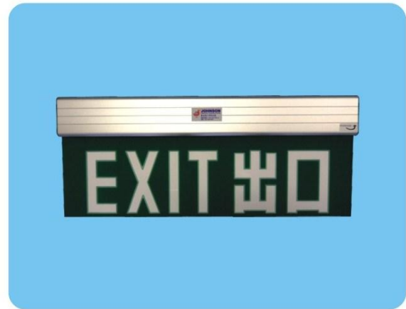
JXPL-600-NH, Emergency LED EXIT sign plate, white L/C on green background.