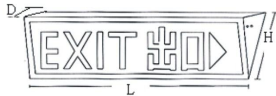
Model : JX14CN2-TNG (Frame Type)