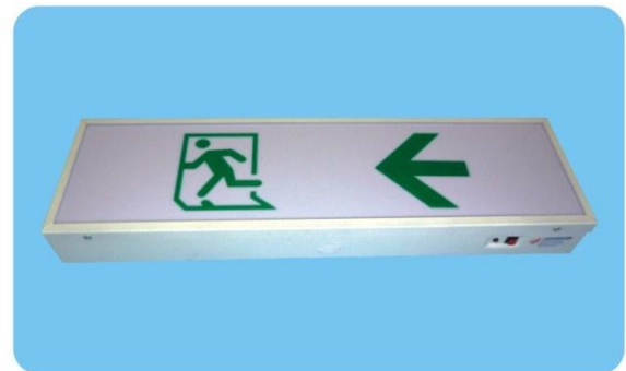
JX20CNH3-D c/w NI-MH rechargeable battery.