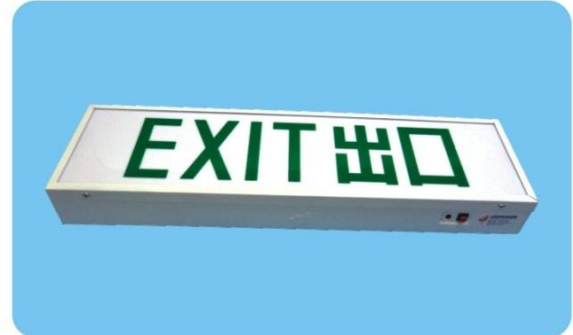
JX20CN2, 1x18W emergency EXIT sign box, green letters/characters on white background.