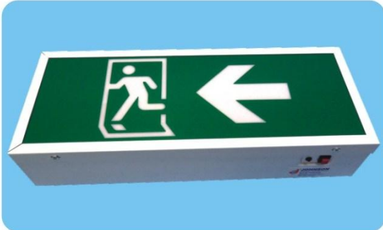
JX10CN2-D 1x10W emergency sign box, white escape route sign with left directional arrow on green background.